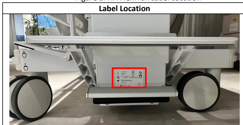
Figure 2. HA FlexTrak Label Location

The HA FlexTrak identification label is positioned on the handgrip side of the trolley below the pump pedal, as shown in Figure 2.