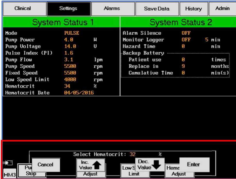
Figure 1 – Example of Atypical Screen Behavior, Overlapping Buttons