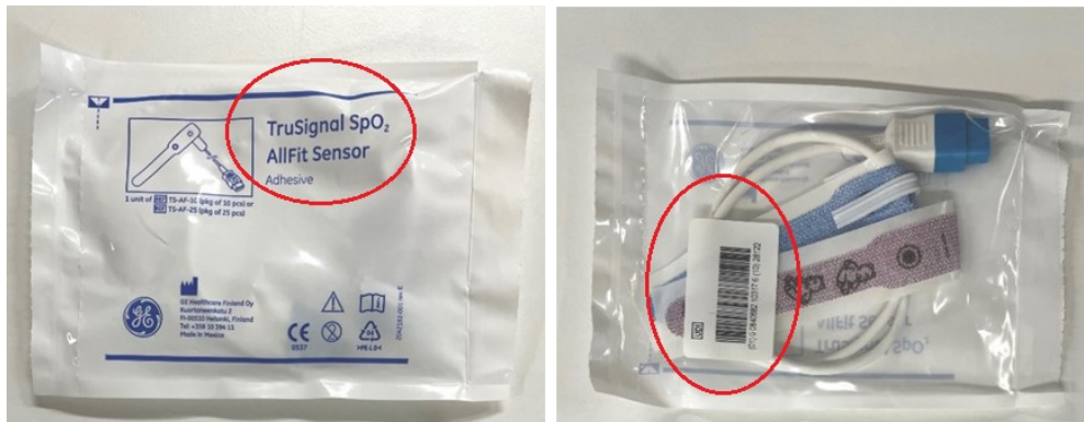
Figure 3: REF/Catalog number, product name & GTIN on Disposable Sensors pouch

For disposable sensors, the product name, model number and GTIN are located on the product packaging as shown in Figure 3.