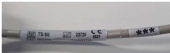
Figure 6: Identification of non-impacted Reusable sensors

INTENDED USE: TruSignal pulse oximetry sensors and interconnect cables are intended for use for continuous non-invasive arterial oxygen saturation (SpO 2 ) and pulse rate monitoring. The devices are indicated for use under guidance of qualified medical personnel only.