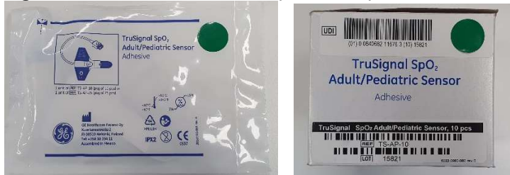
Figure 5: Identification of non-impacted Disposable sensors

In addition to the green circle on their packaging, reusable sensors will also include an additional wrap label with three asterisks (***) next to the GTIN label (See Figure 6). This means that they were inspected by GE HealthCare in manufacturing and are not impacted by the 3 issues in this correction.