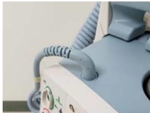
Figure 1: Representative picture of both the old and new Coiled Cable cord design.

New Pump Console Coiled Cord Connection: