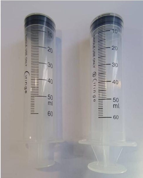
SYRINGE CODE BWE