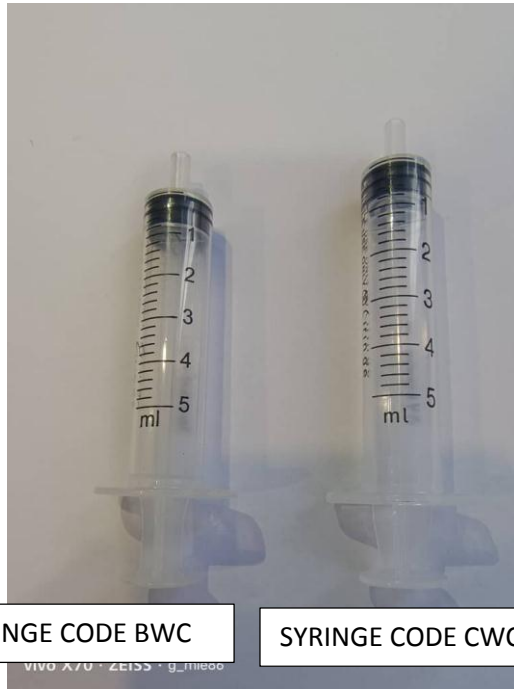
SYRINGE CODE BWC