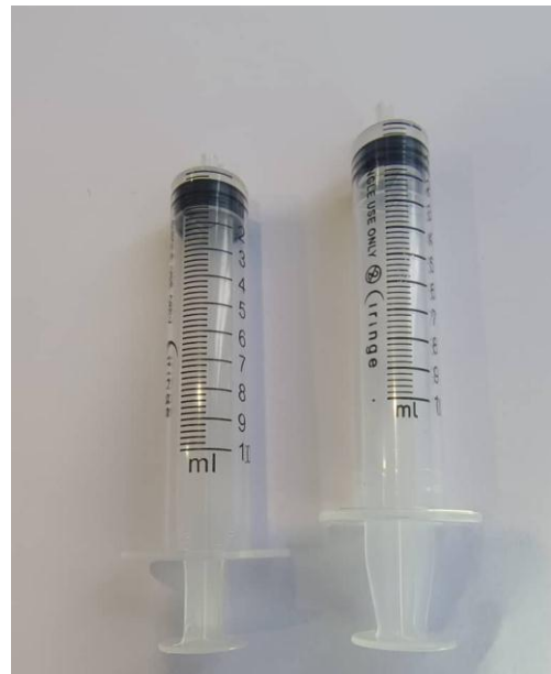
SYRINGE CODE BWE