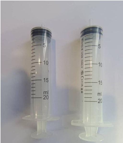
SYRINGE CODE BWE