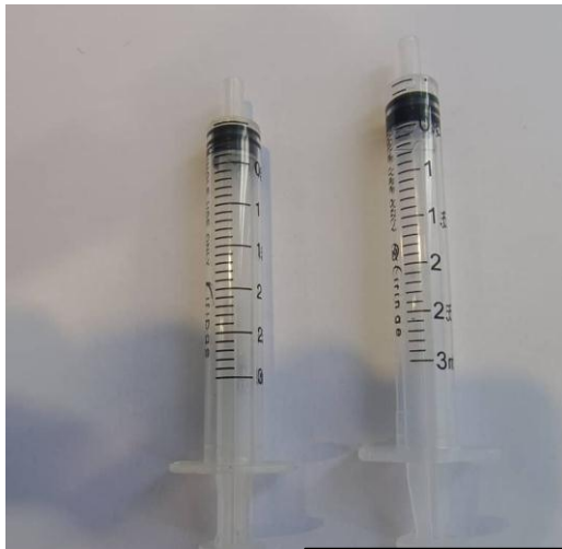
SYRINGE CODE BWC